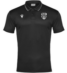
LMFC POLO SHIRT £15.50