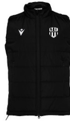
LMFC GILET £47.50