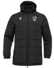
LMFC BENCH JACKET £42.00