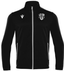
LMFC TRACK TOP £24.30