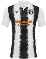
LMFC HOME SHIRT £31.95