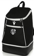
LMFC BACK PACK £20.00