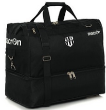
LMFC PLAYER BAG £22.50

order online macronstorenorwich.com/long-melford-fc