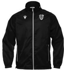
LMFC WINDBREAKER £22.95