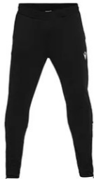
LMFC TRACK PANT £15.90