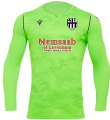
LMFC GK SHIRT £38.85