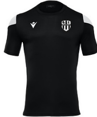
LMFC TRAINING SHIRT £15.50