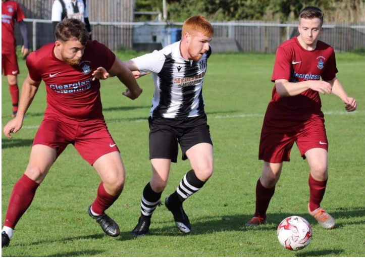
Action from the Reserves' recent home match against Thetford, which ended in a 1-1 draw.